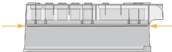
Figure 1 Maximum Water Line