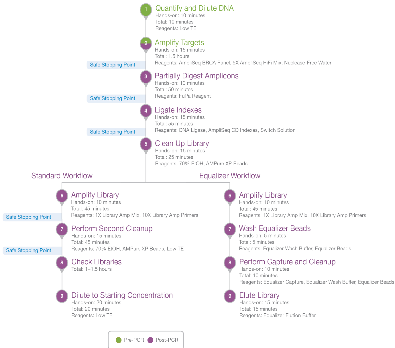
Figure 1 AmpliSeq BRCA Panel Workflow

The following diagram illustrates the AmpliSeq for Illumina BRCA Panel workflow. Safe stopping points are marked between steps.