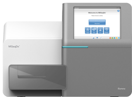
Figure 1: MiSeqDx Instrument—The FDA-regulated, CE-IVD–marked MiSeqDx Instrument offers a simple workflow, user-friendly software interface, and enhanced user security.

The MiSeqDx Instrument is the first Food and Drug Administration (FDA)–regulated and Conformité Européenne in vitro diagnostic (CE-IVD)–marked platform for next-generation sequencing (NGS) (Figure 1). Designed specifically for the clinical laboratory environment, the MiSeqDx Instrument offers a small footprint (0.3 square meters), an easy-to-use workflow, and data output tailored to the diverse needs of clinical labs. Additionally, the on-instrument integrated software enables run setup, sample tracking, user management, audit trails, and results interpretation.* Taking advantage of proven Illumina sequencing by synthesis (SBS) chemistry, the MiSeqDx Instrument provides accurate, reliable screening and diagnostic testing.