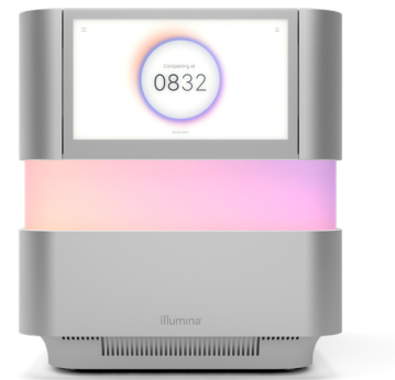
Figure 2: NextSeq 1000 and NextSeq 2000 Sequencing Systems—The NextSeq 1000 and NextSeq 2000 Systems harness XLEAP-SBS chemistry and onboard secondary analysis to streamline sequencing workflows.

The NextSeq 1000 and NextSeq 2000 RNA sequencing (RNA-Seq) solution delivers a clear, complete view of the transcriptome, making it more accessible than ever before. The solution uses industry-leading Illumina next-generation sequencing (NGS) technology, optimized sequencing by synthesis (SBS) XLEAP-SBS™ chemistry, a broad portfolio of library preparation solutions, and data analysis tools to deliver streamlined and efficient workflows (Figure 1). The flexibility and scalability of the NextSeq 1000 and NextSeq 2000 Sequencing Systems (Figure 2) enable users to process a range of sample volumes efficiently, ensuring the optimal balance of read budget and sample throughput. The NextSeq 1000 and NextSeq 2000 RNA-Seq solution supports a range of RNA applications, from basic gene expression profiling to complex whole-transcriptome analyses.