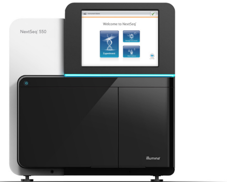
Figure 1: NextSeq 550 System—Proven platform combining the power of NGS and array technologies to support accurate genomic studies across a broad range of applications.

The NextSeq 550 System combines tried-and-true next-generation sequencing (NGS) and array capabilities with tunable outputs, enabling both small and large labs to scale to meet their needs. As a foundational instrument in the Illumina NGS system portfolio, the NextSeq 550 System is ideal for labs that want to expand beyond their current capacity and new labs interested in harnessing the complementary powers of sequencing and genotyping on a single instrument (Figure 1). Its fast DNA-to-results workflow enables rapid sequencing of exomes, targeted panels, and transcriptomes in a single run, with the flexibility to switch to low- or high-throughput sequencing as needed. Illumina scientists are available at every point along the way with support and guidance, enabling large clinical research labs to scale with confidence and smaller labs to employ both genotyping and sequencing technologies.